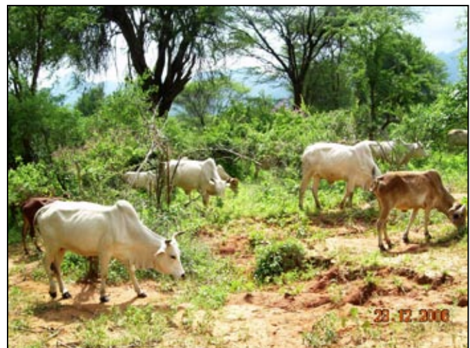
Figure 3. Livestock grazing at Sitin, adjacent to an important area for de Brazza's monkeys in the Mathews Range, Kenya.