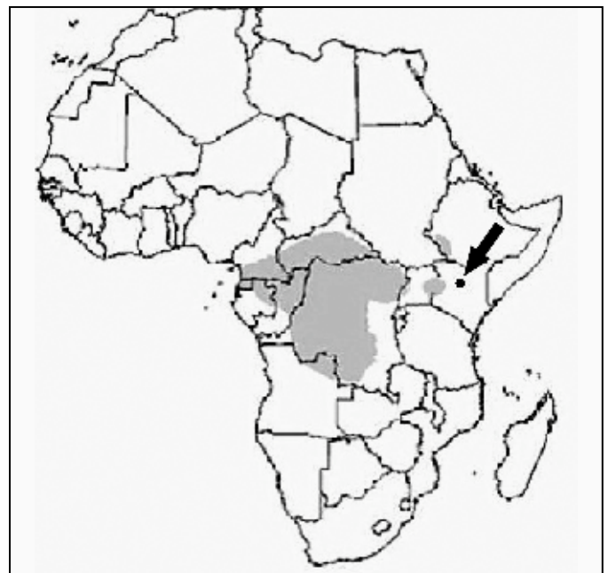
Figure 1. The map of distribution of de Brazza's monkey ( Cercopithecus neglectus ) in Africa, showing the newly discovered population in Mathews Range Forest Reserve (black dot), the first record of the species east of the Great Rift Valley.

A total of 162 de Brazza's monkeys in 24 groups were counted during the survey. These included 139 adults and sub-adults and 23 infants (Table 1). These were found in ten separate laggas throughout the mountain range, save for the northwestern part where the presence of the species needs to be investigated further. By extrapolating information gathered on this study—from interviews and field observations—the population of the entire Mathews Range Forest Reserve was estimated at 200–300. The first ever record of de Brazza's monkey occurring above 2,100 m above sea level was recorded in the Mathews Range at 2,203 m at Olkaela.