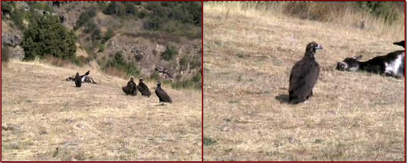
Figure 11. Shots from a vide film featuring the feeding of vultures

Conservation project in Armenia. The material is available as draft and needs to be assembled and edited.