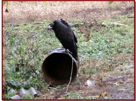
Black vulture which was kept in household as pet and died

Firstly, the period of time during which the wild plants and grasses are collected by local villagers overlaps with the period of incubation and hatching (April – May), and major breeding habitats (open juniper woodlands) of Black Vulture. Groups of people collecting wild plants are composed of three to five individuals where children are common. Because vulture nests appear to be large constructions and are seen at a distance, a disturbed bird attracts more attention, especially those of children who ascend to a fairly accessible height (nest platform). Inquisitively, they break their eggs open to look inside, or if a nestling is found in the nest they would take it home for the purpose of pet maintenance which results in the death of a nestling.