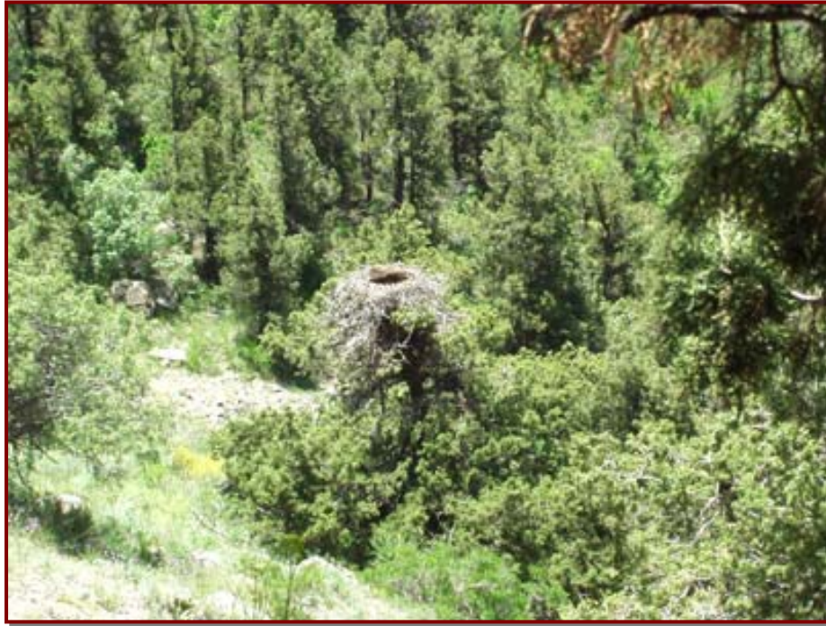
Figure 5. Nest positioned in a denser part of the woodland facing S

From the experience of the past project when a 10-12 day-old chick was taken away by a lynx at night, we undertook efforts to prevent predation in the current year and applied a solution of chemical reagents to individual nest trees once in 3-5 days. No case of predation (lynx, bear, etc.) was recorded in the reporting period. The end of the nesting period was earmarked by 7 nestlings which fledged successfully and represented 100% of the fledging success. Hence, in summary, our efforts allowed to eliminate two of the limiting factors discussed below, predation and human disturbance.