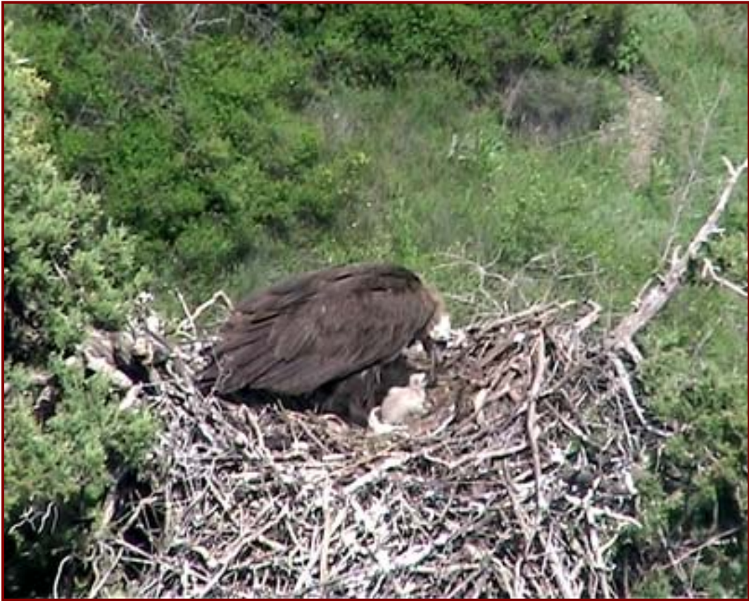
Figure 4. Adult vulture on the nest