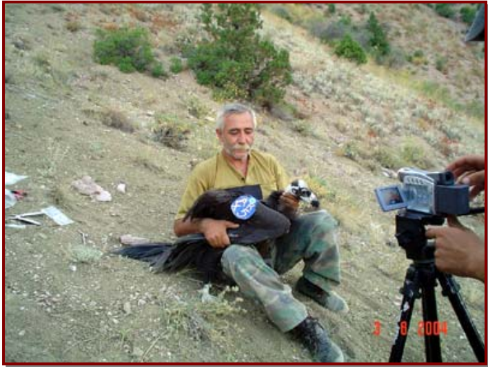
Figure 7. Vulture banded with a wing tag and an aluminum metal ring