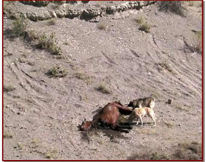
Figure 8. Laying down a donkey carcass for vulture feeding

Supplementary feeding to vultures in the State Khosrov Preserve commenced in early days of the project and was carried out through the entire breeding season and well into winter. Feeding stations were established in suitable places in subalpine, mountain steppe and semi-desert habitats, taking into account inaccessibility for mammalian predators/scavengers. Based on experience of the previous practice, a feeding station was established within the area of preserve, because carcasses placed outside the protected area which covered mountain meadows were basically taken away by shepherd dogs which kept vultures away from the food. Carcasses spread out within the area of preserve were often visited by bears during the night which did not react to chemical repellents and dragged the carcass into bushes and buried in forest. The entire research team and volunteers working on the project had to guard permanently the carcasses intended for vultures to accomplish the task of supplemental feeding of Black Vulture.