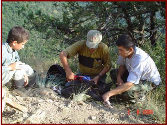
Figure 6. Installing a tag on the black vulture wing