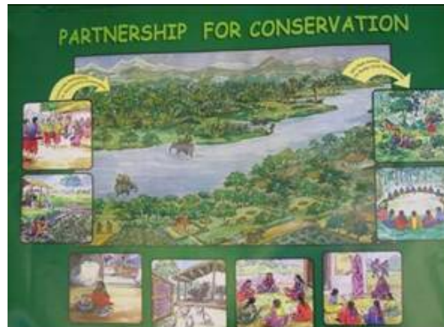
Figure: Overall Community-based biodiversity conservation model in the buffer zone of Bardia National Park

An Assessment of Community-based Biodiversity Conservation and Rural Livelihood Improvements in the Buffer Zone of Bardia National Park, Nepal