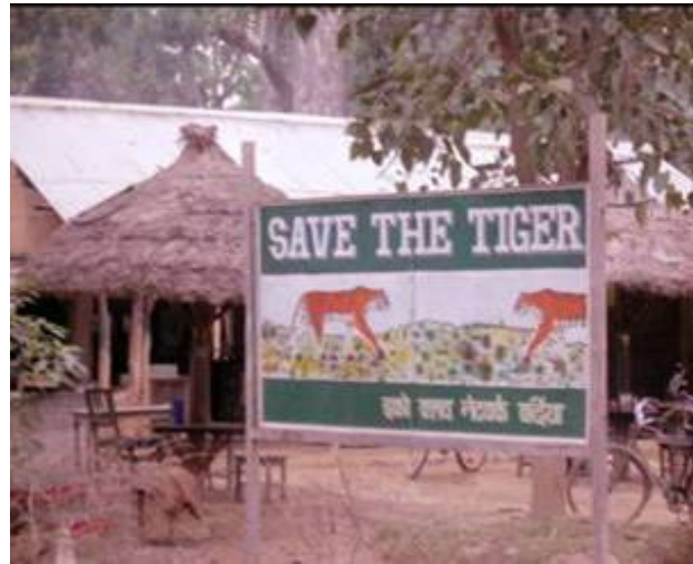
Photo: Bardia National park is a prime habitat of Tiger. Due to increase in poacher within park, they are going to disappear so local community have been managing through formation of eco-club toward Tiger conservation

Therefore, the management system of BZCF should be further boosted by providing economic, institutional and moral supports by the park and donor agencies so as to develop the well institutionalized local stewardship in conservation.