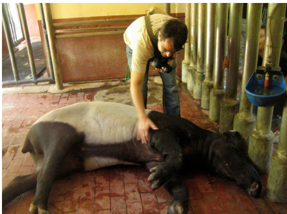
Visiting the Wildlife Conservation Centre, Sungai Dusun, Selangor, Malaysia during the Tapir DNA workshop.

Finally, I was invited by the Department of Wildlife and Natural Parks of Malaysia to attend the Tapir DNA workshop, a meeting designed for capacity building of regional scientists on non-invasive genetic techniques. At this workshop, I presented a small talk about the work being developed in the Amazon, along with all the subsidiary work.