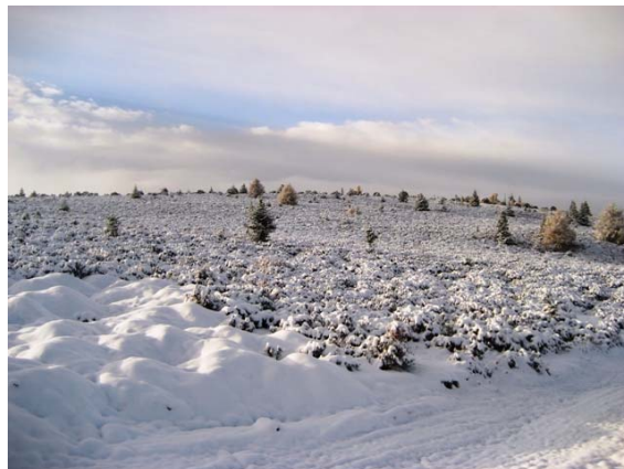
Plate 3 Heavy snow at Pamuling in December 2008;