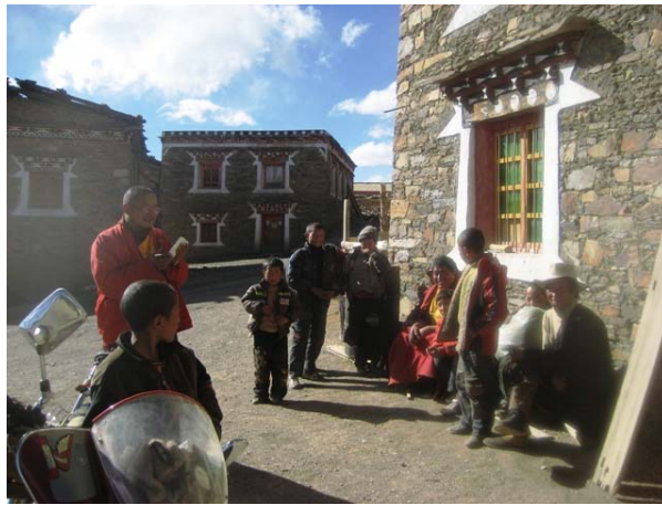
Plate 5 The Lama of the Pamuling was making a speech about the value of the Sacred Forest to the younger monks and Tibetan people.