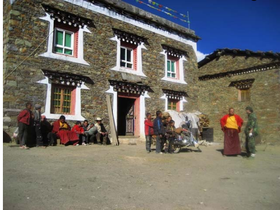
Plate 4 Mr.Xu Yu was explaining the importance of the Sacred Forest to Lama of Pamuling Monastery