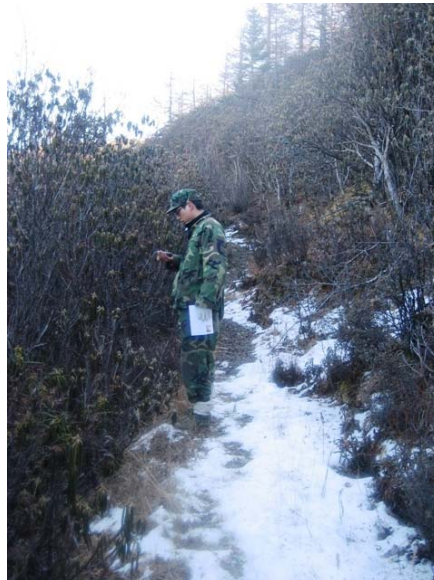
Plate 2 Mr. Yu Xu was collecting field data in Pamuling;