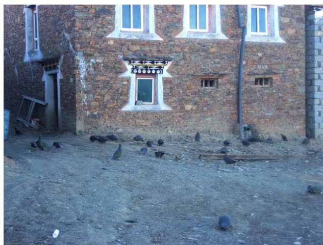
Plate. 6 The Blood Pheasant in Pamuling Monastery.