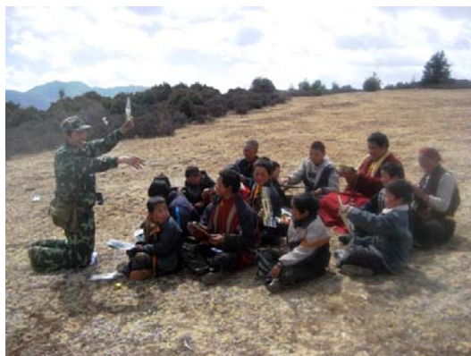
Fig.7 In Pamuling Monastery