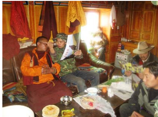
Fig.4 In local community