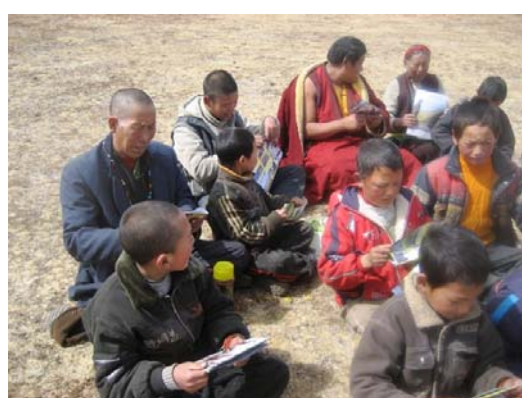
Fig.8 In Pamuling Monastery