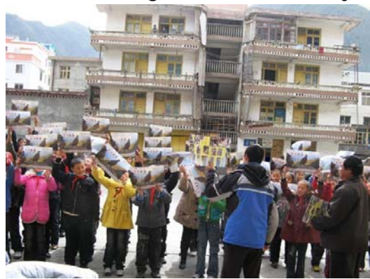
Fig.2 In local school