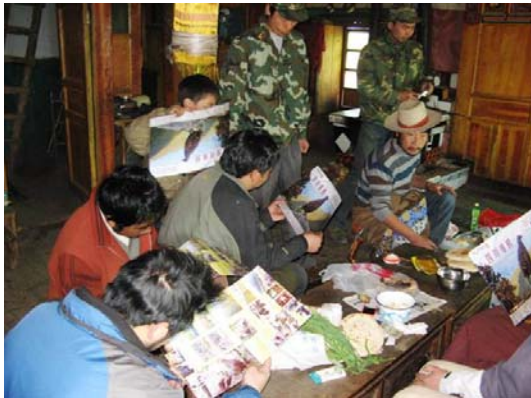
Fig.3 In local community