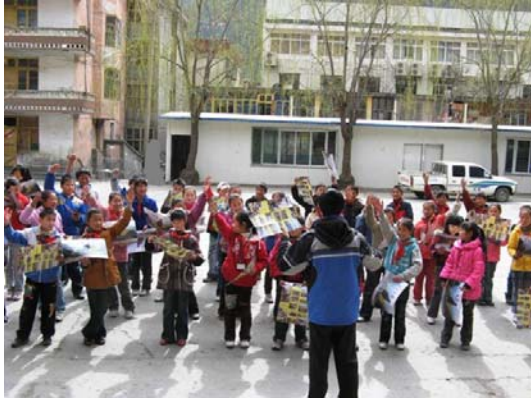
Fig.1 In local school