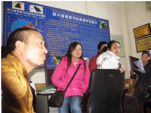
Fig.5 In Yajiang Forest Bureau