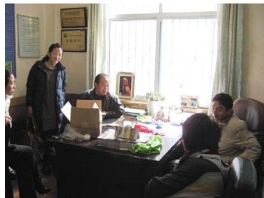
Fig.6 In Yajiang Forest Bureau